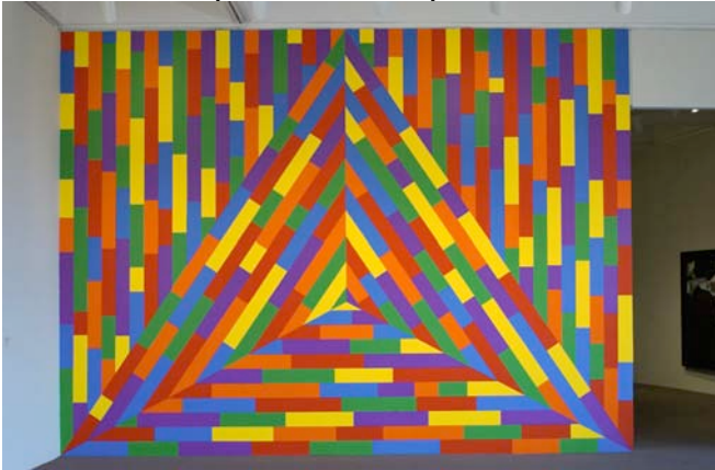
Sol Lewitt's Wall Drawing #1113 On a wall, a triangle within a rectangle, each with broken bands of color, 2003, from the Hirshhorn's collection.