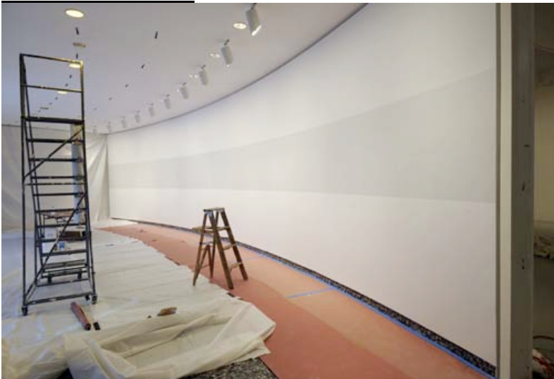
Installation of Sol Lewitt's Wall Drawing #3 , 1969, from the Hirshhorn's collection, The Panza Collection.

Sol LeWitt was a revolutionary artist who helped pioneer both the Minimal and Conceptual art movements. LeWitt is most well known for his brightly colored, mural-sized wall drawings, for which he devised instructions and installation possibilities, but then handed over to others to actually fabricate and/or install. From his detailed directions, which were sometimes precise, other times vague, geometric shapes, lines, repetition, and color, which may initially appear to be extremely simple, combine to create a stunning, powerful visual effect, typically encompassing large stretches of wall space.