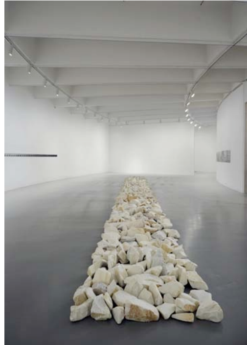
Richard Long's Carrara Line , 1985, from the Hirshhorn's collection, The Panza Collection.

Wandering through diverse landscapes in locations around the world is a crucial part of Long's process of questioning the conventional concepts about what art is. He documents these walks and later, using site-specific natural materials such as mud, rocks, or sticks, creates an artwork based on his experience of that specific time and place.