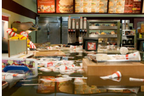
Still photo from "Flooded McDonald's" (2008).