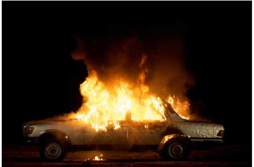
Still photo from "Burning Car" (2009).