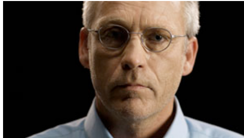
Still photo from "The Financial Crisis" (2009).