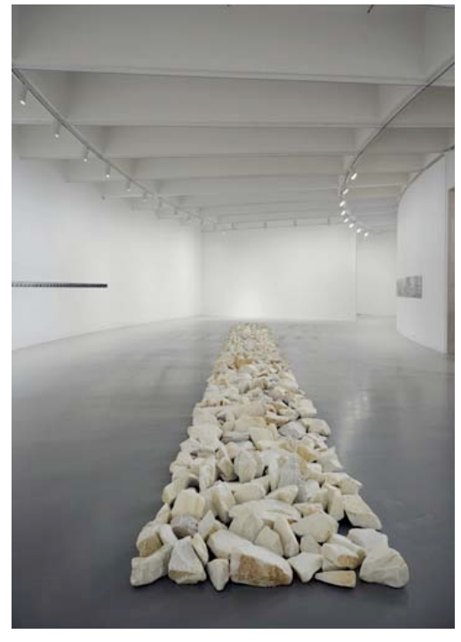
Richard Long's Carrara Line , 1985, from the Hirshhorn's collection, The Panza Collection.

Wandering through diverse landscapes in locations around the world is a crucial part of Long's process of questioning the conventional concepts about what art is. He documents these walks and later, using