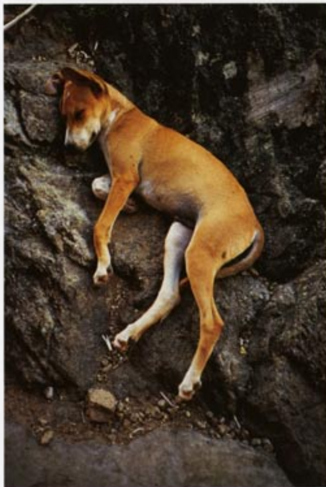
Sleeping Dog , 1990, Cibachrome