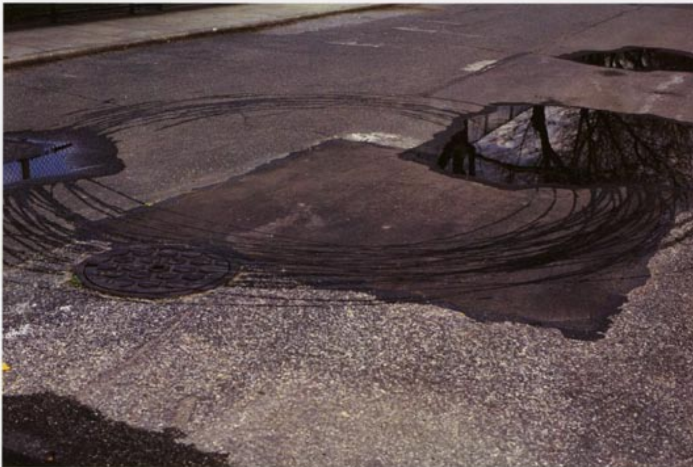
Extension of Reflection, 1992, Cibachrome