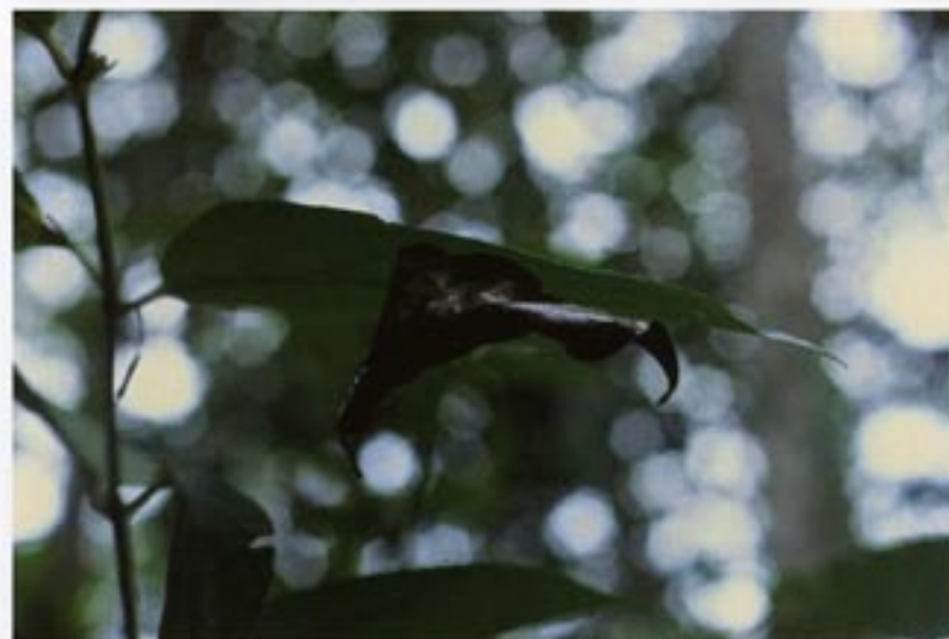
Common Dream , 1996, Cibachrome Turista Maluco , 1991, C-print