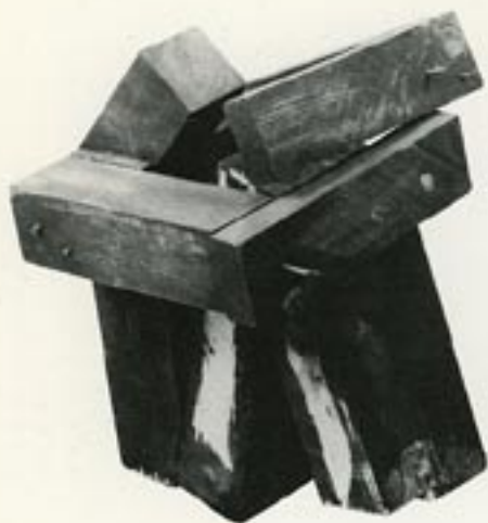
Figure 2. Untitled, 1981. Oil on wood with nails, 11 1/4 x 8 1/4 x 8 3/4 inches. Lewis and Susas Manilow, Chicago.

Another figurative work from 1982 (cover) discloses the dichotomy between the active and passive states of mind. The figure is lying on the floor on its side, but it appears to be running, with left hand extended and right knee fully flexed. The paint covering the head and neck area was inspired by the cobalt-violet color Picasso had used in the 1930s to depict reclining figures in a dream state. "It is a color that tends to dissolve form," Shapiro explained. Instead of camouflaging or unifying the work, the pigment calls attention to specific areas. The sculpture fuses the sleeping state with a posture that suggests someone pursuing a dream, and the arrangement of the blocks of wood seems almost temporary. Like the other overtly figurative works, however, there is a balance between the abstract, formal elements and the subject matter.