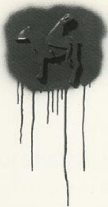
Figure 1. Untitled, 1973. Enamel on wood, 6 1/2 x 6 1/2 x 1 1/8 inches. Michael and Nadia Goedhuis, London.

For Shapiro, paint has many functions. In an untitled work from 1973 (fig. 1) he used paint to veil the small horse mounted by a rider facing backward, spraying it in a spontaneous gesture. Given the spatial demands and nonobjectivity the sculpture of the 1960s had established, he thought it necessary to conceal this vulnerable, image-oriented work, which is clearly personal in nature. Despite its size, the object commands considerable space on the wall; in that light, its scale is not in fact small. Although this work can be discussed in formal terms, the drips of green spray paint signal its emotional impact. The sculpture addresses