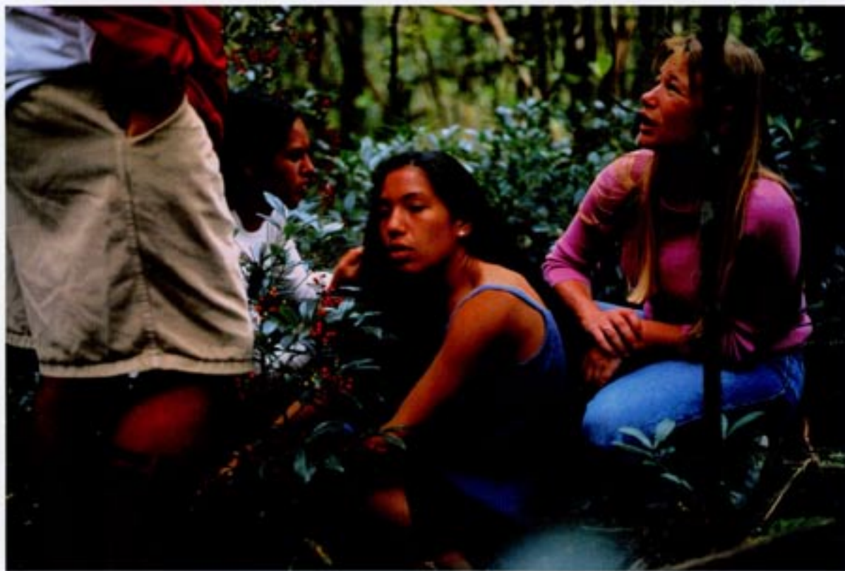
Uti , 2000, Cibachrome, 30 x 45 in. (76.2 x 114.3 cm). Collection Tim McCoy.