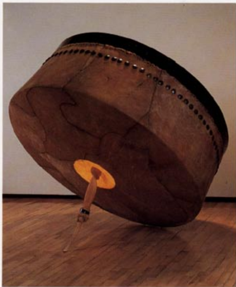
The Opera of Silence , 1988. Wood, bog hide, steel, theatrical make-up, paper, bone, ink, plastic; 66 x 70 x 67 in. Collection of the artist, courtesy Franklin/Adams Gallery.