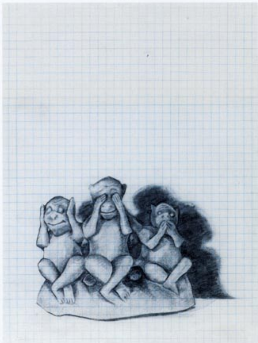
Fig. 3. What It's Like, What It Is: #2 , 1991 (detail, drawing for wallpaper). Courtesy the artist and John Weber Gallery, New York.