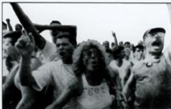
Fig. 2. What It's Like, What It Is #2 , 1991 (detail, photographic cutout).

"The images from the fashion pages . . . are just cleaned-up versions of the images that are taken from these news stories. They embody power and arrogance more iconically because they are disassociated from particular crimes that might soil them."