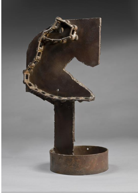
David Smith Chain Head, 1933 The Estate of David Smith, New York