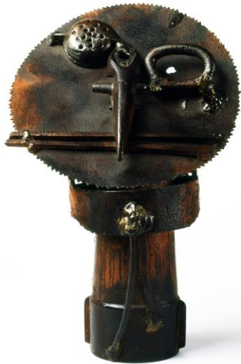
David Smith Saw Head, 1933 The Estate of David Smith, New York