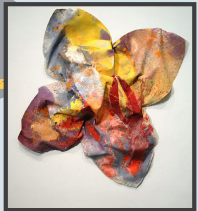
Ruby Light by Sam Gilliam, 1972

Artist Sam Gilliam (b. 1933) is a painter and member of the Washington Color School. During the 1960s and 70s many people thought African Americans should make art about civil rights. He defied this by making colorful experimental artworks inspired by the world around him.