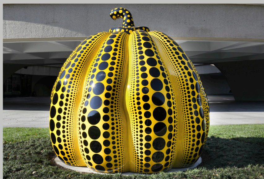
Pumpkin by Yayoi Kusama, 2016.

What do you see? Describe the colors and shapes. Do you notice any patterns? Talk together about the pumpkin. Does it look real? Why, or why not?