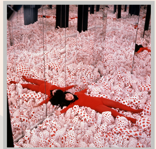
Yayoi Kusama. Installation view of Infinity Mirror Room—Phalli's Field , 1965.

Dot-covered pumpkins are a common theme in her work. Pumpkin by Yayoi Kusama (2016) is an eight-foot tall sculpture covered in repeating patterns of different sized dots.