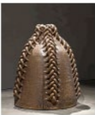
Simone Leigh American, b.1967, Chicago, IL "Village Series," 2023 Stoneware Approximately 55 x 47 1/2 x 47 1/2 in (139.7 x 120.7 x 120.7 cm) Courtesy the artist and Matthew Marks Gallery