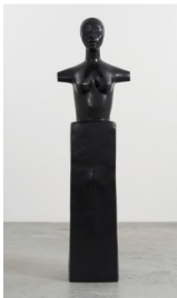
Simone Leigh American, b.1967, Chicago, IL "Herm," 2023 98 x 30 x 28 inches in (249 x 76 x 71 cm) Bronze