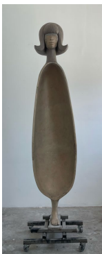
Simone Leigh American, b.1967, Chicago, IL "Vessel," * 2023 Approximation: 110 x 25 x 20 in (279.4 x 63.5 x 50.8) Bronze *Placeholder image of clay model