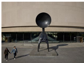
Simone Leigh American, b.1967, Chicago, IL "Satellite," 2022 24 ft x 10 ft x 7 ft 7 in (7.3 x 3 x 2.3 m) (overall, assembled); approximately 6900 lbs (3129.8 kg) Bronze Courtesy the artist and Matthew Marks Gallery