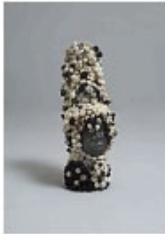
Simone Leigh American, b.1967, Chicago, IL "Overburdened with Significance," 2011 Porcelain, terracotta, and graphite 22 x 8 x 14 in (55.9 x 20.3 x 25.6 cm) Bridgitt and Bruce Evans