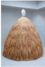
Simone Leigh American, b.1967, Chicago, IL "Cupboard," 2022 135 1/2 × 124 × 124 in (344.1 × 315 × 315 cm) Stoneware, raffia, and steel armature Glenstone Museum, Potomac, MD