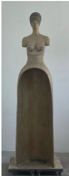
Simone Leigh American, b.1967, Chicago, IL "Bisi," * 2023 Dimensions TBD Approximation: 130 x 28 x 23 in (330.2 x 71.12 x 58.42 cm) Bronze Courtesy the artist and Matthew Marks Gallery *Placeholder image of clay model