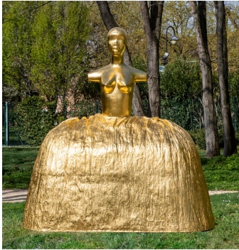
Simone Leigh American, b.1967, Chicago, IL "Cupboard," 2022 88 1/2 x 85 x 45 in (225 x 216 x 114.3 cm) Bronze and gold Courtesy the artist and Matthew Marks Gallery