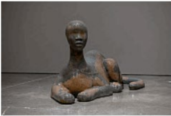
Simone Leigh American, b.1967, Chicago, IL “Sphinx,” 2022 29 3/4 × 56 3/4 × 35 in (75.6 × 144.1 × 88.9 cm) Stoneware Glenstone Museum, Potomac, MD