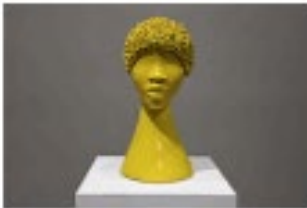
Simone Leigh American, b.1967, Chicago, IL "Untitled," 2023 Stoneware 24 × 11 × 13 in (61 × 27.9 × 33 cm) Courtesy the artist and Matthew Marks Gallery