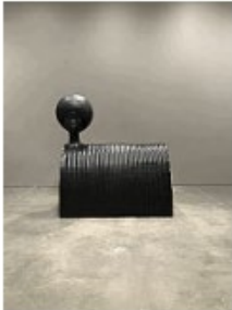
Simone Leigh American, b.1967, Chicago, IL "Sentinel," 2019 69 1/2 × 65 × 41 in (176.5 × 165.1 × 104.1 cm) Bronze Private collection, Boston