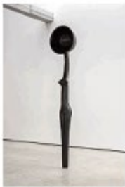
Simone Leigh American, b.1967, Chicago, IL "Sentinel IV," 2020 128 x 25 x 15 in (325.1 x 63.5 x 38.1 cm) Bronze