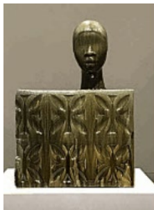
Simone Leigh American, b.1967, Chicago, IL "Breeze Box," 2022 37 1/2 × 26 × 23 3/4 in (95.3 × 66 × 60.3 cm) Stoneware Courtesy the artist and Matthew Marks Gallery