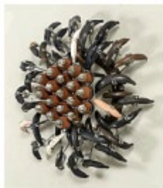
Simone Leigh American, b.1967, Chicago, IL "Brooch #2," 2008/2023 49 × 49 × 9 in (124.5 × 124.5 × 22.9 cm) Porcelain, terracotta, lab apparatus, steel, and gold luster