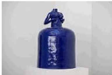
Simone Leigh American, b.1967, Chicago, IL “Martinique,” 2022 60 3/4 × 41 1/4 × 39 3/4 in (154.3 × 104.8 × 101 cm) Stoneware Courtesy the artist and Matthew Marks Gallery